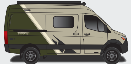
Forest Glade Partial Paint (Sandstone Van Only)