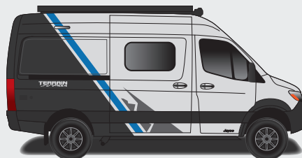
Aztec Partial Paint (Silver Van Only)